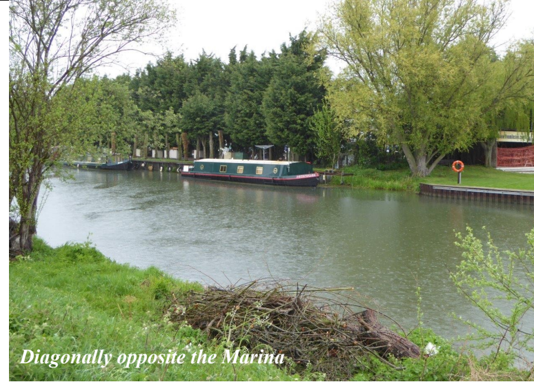
Diagonally opposite the Marina