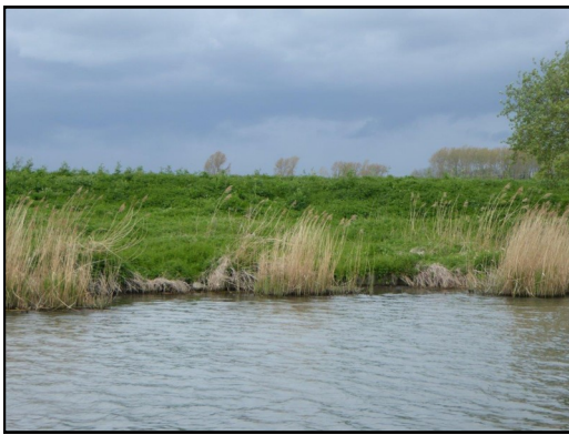
Site across the river on the western bank