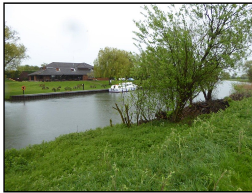
Looking from the site across river towards the No Hurry Inn