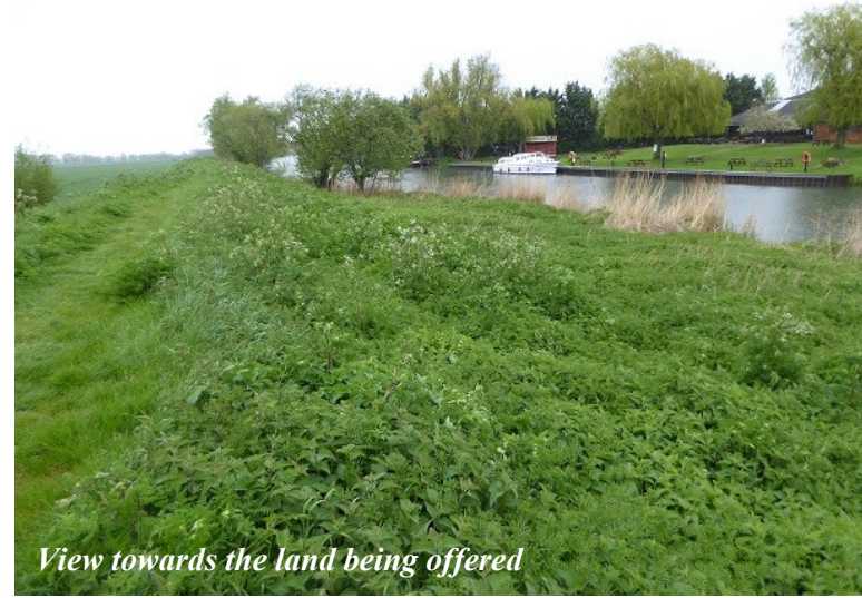
View towards the land being offered