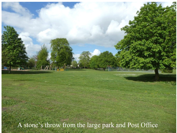
A stone's throw from the large park and Post Office