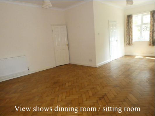
View shows dinning room / sitting room

Via the letting agent, Messrs. Snow Walker, who holds keys.