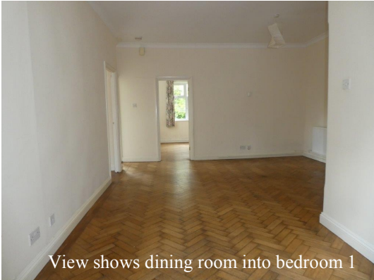
View shows dining room into bedroom 1