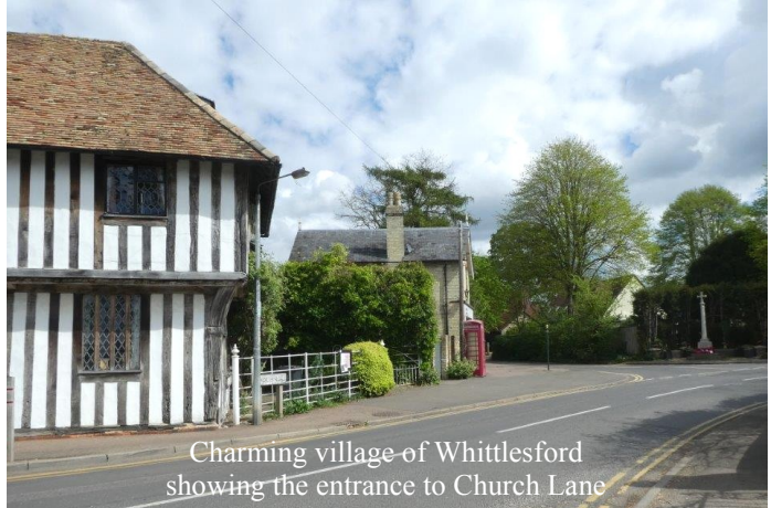
Charming village of Whittlesford showing the entrance to Church Lane