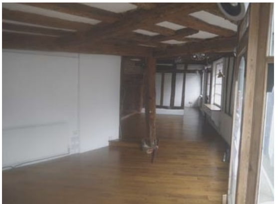
Retail Space to the front of the Shop

Via the letting agent, Messrs. Snow Walker, who hold keys.