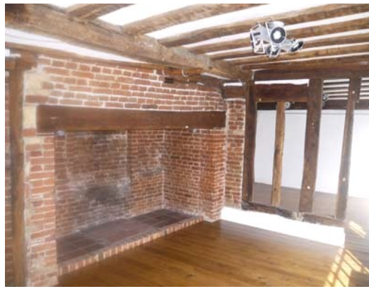
Featured Fire Place and Beams