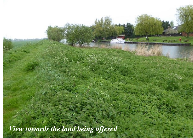
View towards the land being offered

The footpath along the riverbank then leads to the land which is opposite the Upware Marina, shown on the attached plan.