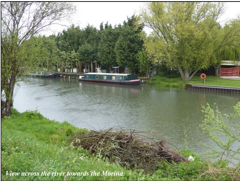
View across the river towards the Marina.